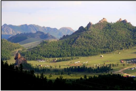
TERELJ NAT'L PARK