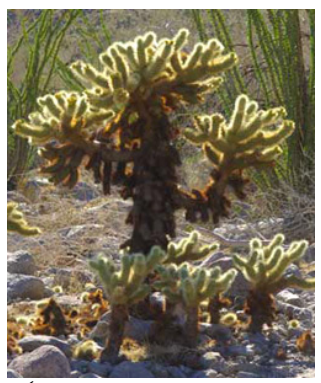
✓ If seen 5 Points

Did you Know? The leaves of the brittlebush plant have many very small hairs that give it a silvery color. The hairs help to protect the leaves from the heat of the sun and also to trap moisture and prevent the leaves from drying out.