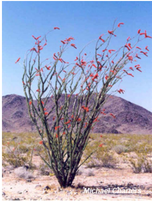
✓ If seen ___15 Points